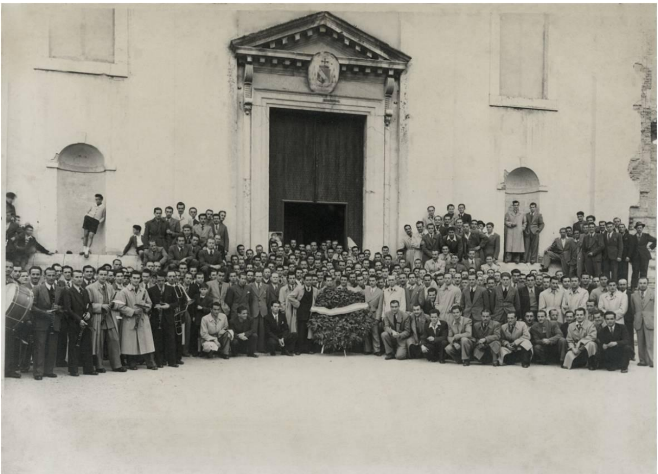
Thiene, 28 October 1945. Former prisoners of war organise a thanksgiving celebration for their return, attending a Holy Mass in suffrage for the fallen and in gratitude.

(motivation published in Presidential Decree No. 2086 dated May 13, 2024, regarding the awarding of the Silver Medal for Military Valour to the Municipality of Thiene for partisan activity)