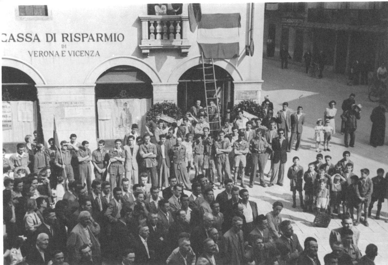
Thiene, 5 August 1945. Naming of the main square after Giacomo Chilesotti.

A recognition granted so long after the end of the war might at first appear difficult to understand; however, precisely because of its uniqueness and the long process that preceded it, it offers an opportunity and a valuable stimulus to explore and rediscover the history of the City and its territory within the broader context of twentieth-century events.